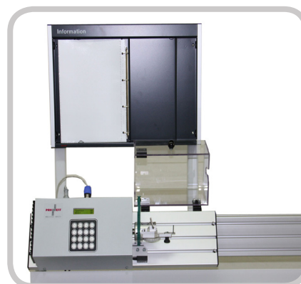
Info sign and core blank holder