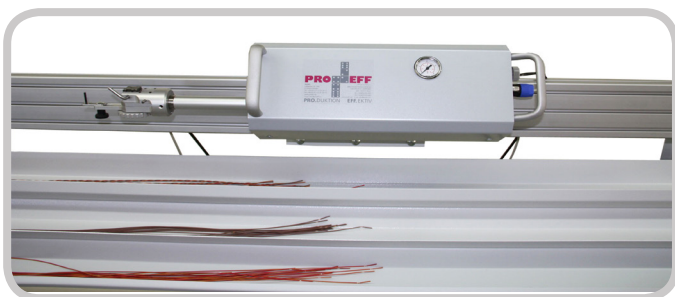
Pneumatic tensioning carriage